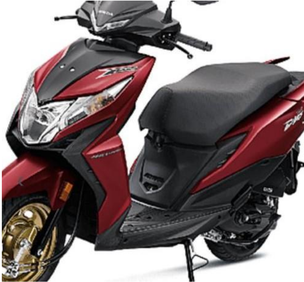
Mat Sangria Red Metallic