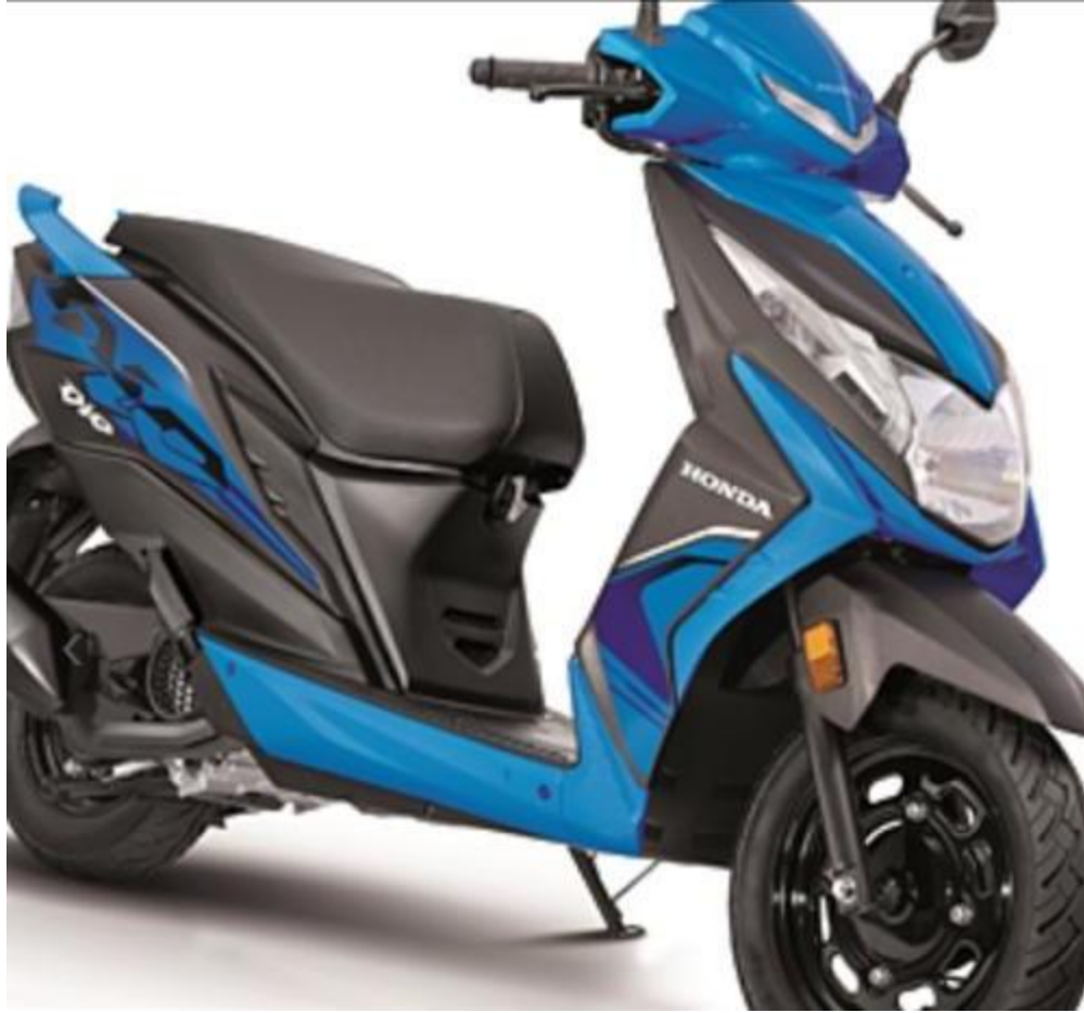
Mat Marvel Blue Metallic