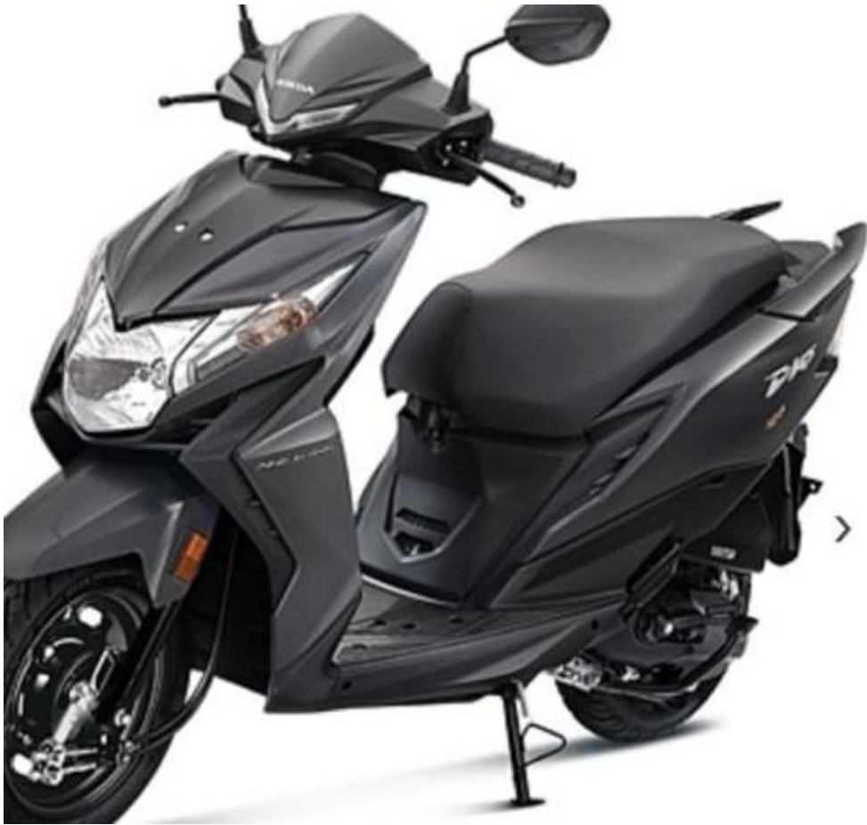
Pearl Night Star Black