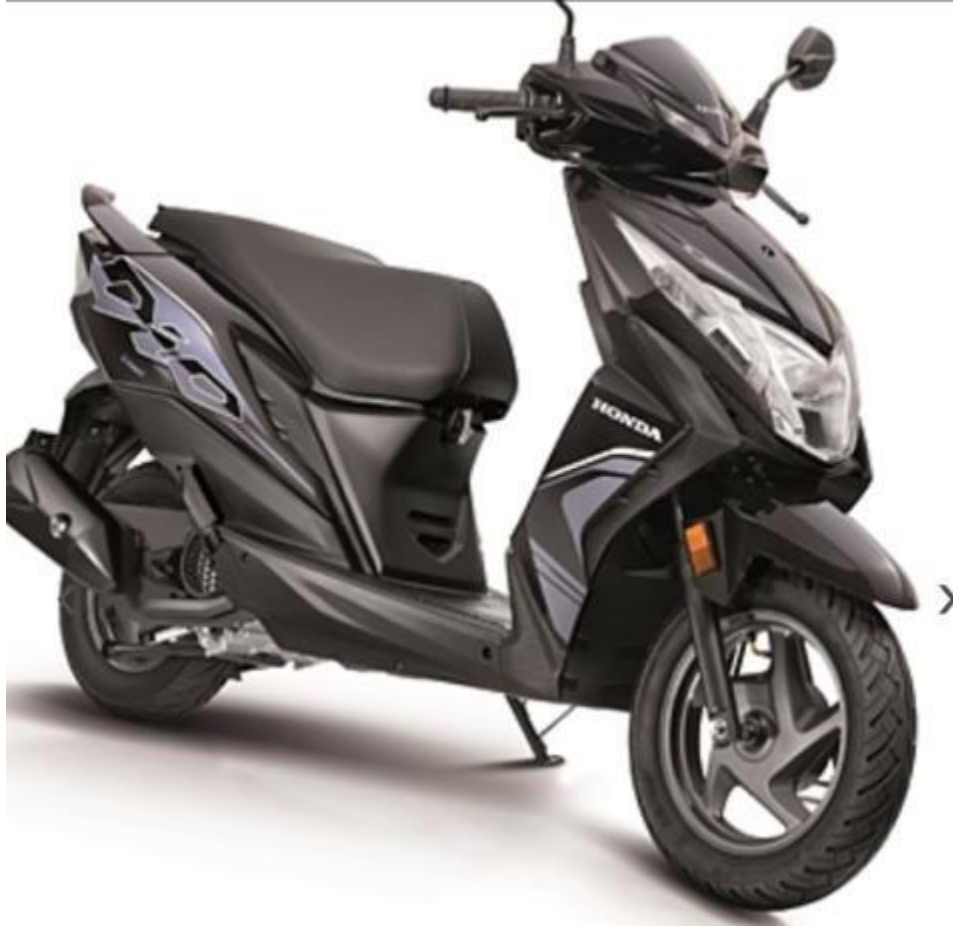
Mat Axis Gray Metallic