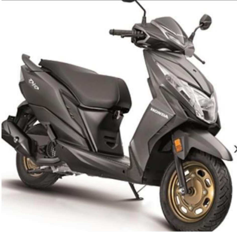
Pearl Deep Ground Gray