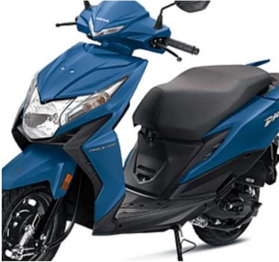
Pearl Siren Blue