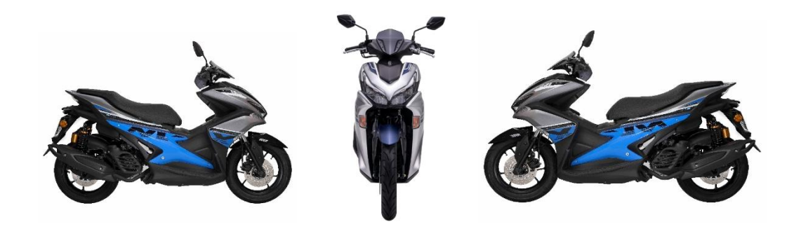
SILVER /GREY (RIMS & STICKERS IN DESIRED COLORS)