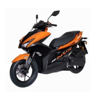
PHOSPHOR & BLACK (RIMS & STICKERS IN DESIRED COLORS)